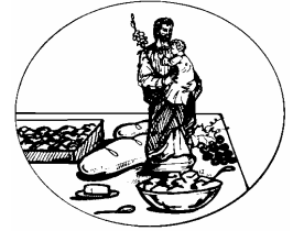
St. Joseph Table

According to legend, the St. Joseph Table originated in Sicily several centuries ago, during a period of severe drought and famine. The people were starving and all they could grow were fava beans. In desperation, they prayed to St. Joseph, the protector of the Holy Family. He answered their prayers by sending good rains and an abundant harvest to end the famine. To thank and honor St. Joseph, the people built altars consisting of grains, fruits, vegetables, seafood and wine. The food was served to the poorest of the poor and was shared in prayer and festivity. As the Italian people migrated to the New World, they brought with them this unique and beautiful tradition that is carried on in homes and churches throughout the United States today.