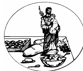
St. Joseph Table

St. Joseph Table Committee will host the St Joseph Table on Sunday, March 19th at 1:00 pm until 4:00 pm. Volunteers are needed for this event to continue to be successful.