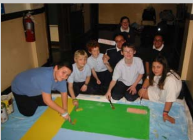
Photos below are the Crew of "Dear Edwina, Jr." diligently working on the set!

Tickets will be available at the parish office! Watch the bulletin for further details.