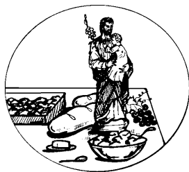
St. Joseph Table

Sunday, March 13th From 1:00 pm until 4:30 pm