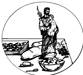
St. Joseph Table

Week of February 6: $ 1,079 YTD: $21,177